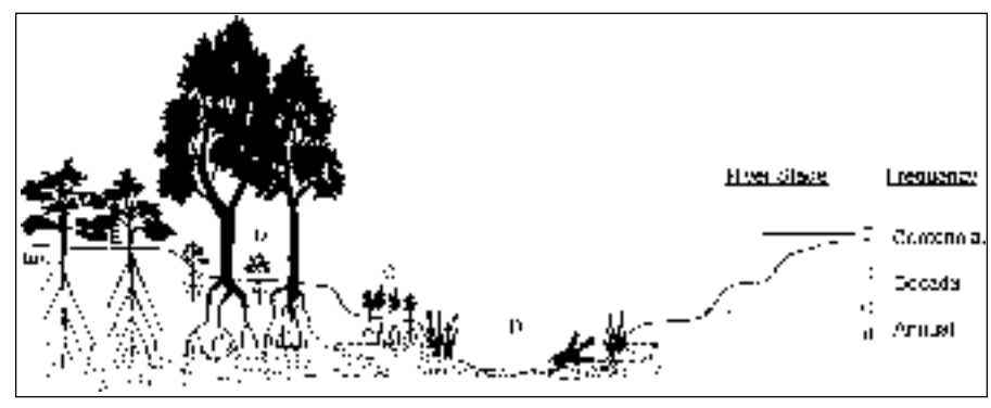
Figure 4. Geomorphic and ecological functions provided by different levels of flow. Water tables that sustain riparian vegetation and that delineate in-channel baseflow habitat are maintained by groundwater inflow and flood recharge (A). Floods of varying size and timing are needed to maintain a diversity of riparian plant species and aquatic habitat. Small floods occur frequently and transport fine sediments, maintaining high benthic productivity and creating spawning habitat for fishes (B). Intermediate-size floods inundate low-lying floodplains and deposit entrained sediment, allowing for the establishment of pioneer species (C). These floods also import accumulated organic material into the channel and help to maintain the characteristic form of the active stream channel. Larger floods that recur on the order of decades inundate the aggraded floodplain terraces, where later successional species establish (D). Rare, large floods can uproot mature riparian trees and deposit them in the channel, creating high-quality habitat for many aquatic species (E).

Flows of low magnitude also provide ecological benefits. Periods of low flow may present recruitment opportunities for riparian plant species in regions where floodplains are frequently inundated (Wharton et al. 1981). Streams that dry temporarily, generally in arid regions, have aquatic (Williams and Hynes 1977)